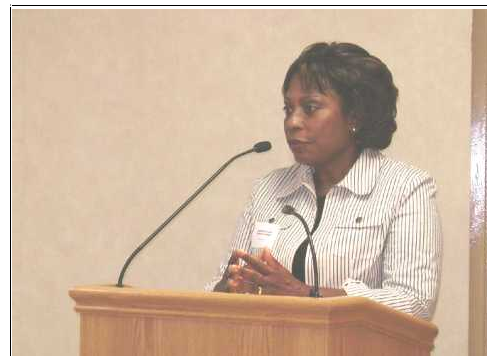
Assemblywoman Earlene Hooper (18 A.D.) speaks about the tough economic times facing Long Island.