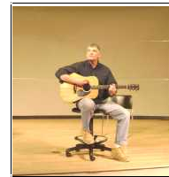
PR/Programming Division Talent Showcase