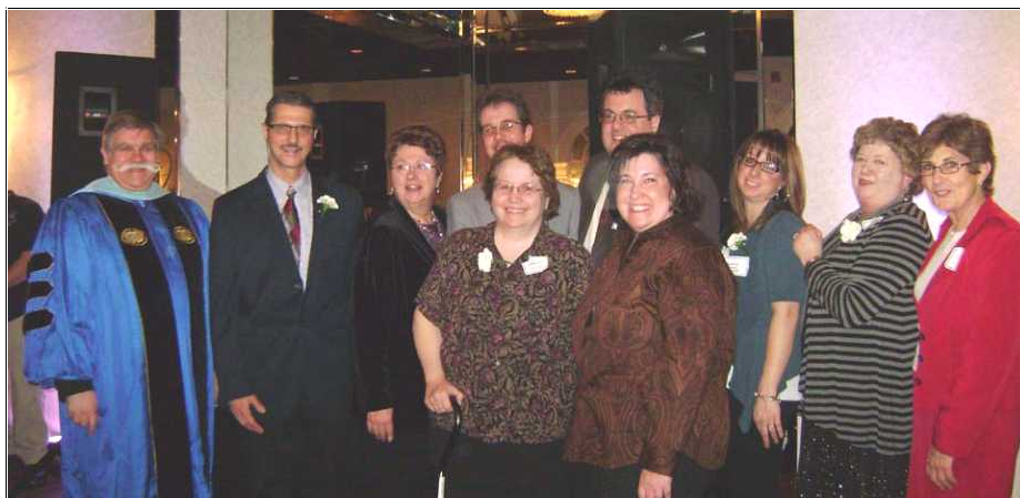
2011 NCLA Executive Board