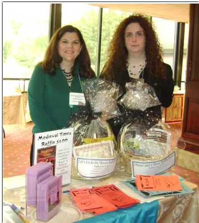
⇒ NCLA PR/ Programming Division Table