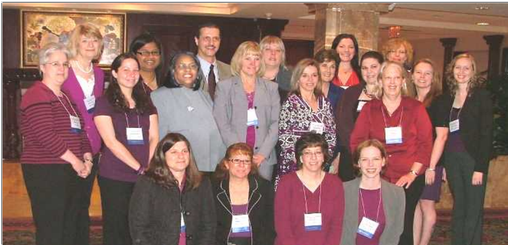
2010 Long Island Library Conference Committee