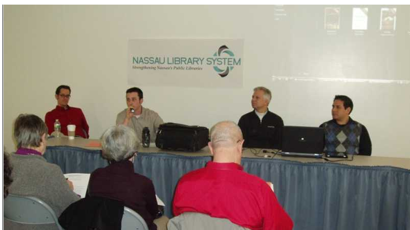
"Demystifying the Download"

The Reference and Adult Services Division, in conjunction with the Media Services Division held an informative program, "Demystifying the Download" on ebook and audio book devices which took place on Tuesday, January 18, 2011, in the NLS Ballroom.