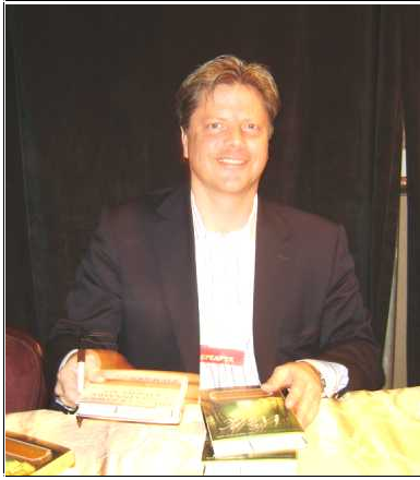
Richard Paul Evans Keynote Speaker