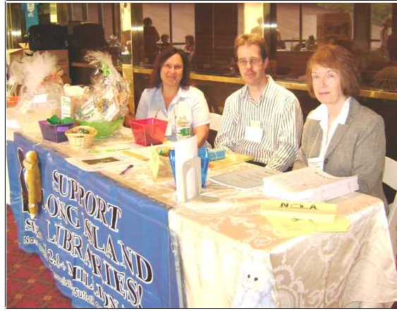
NCLA Table at the Long Island Library Conference