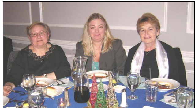
↑ Staff members from the Elmont Public Library.