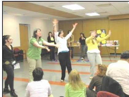
"Bringing Stories to Life through Drama," April 2012