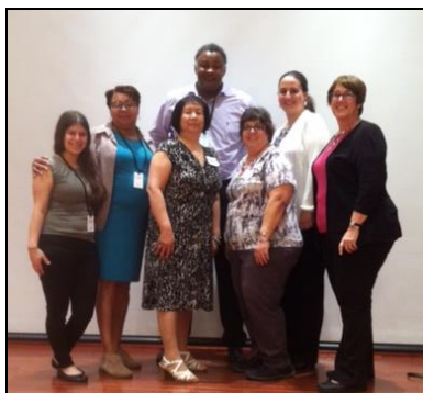
Performers Showcase Team

It's been a great year! I really felt the love and support this year with increased membership and well-attended programs. The Performers Showcase was once again very well-received, and all the wonderful comments were appreciated.