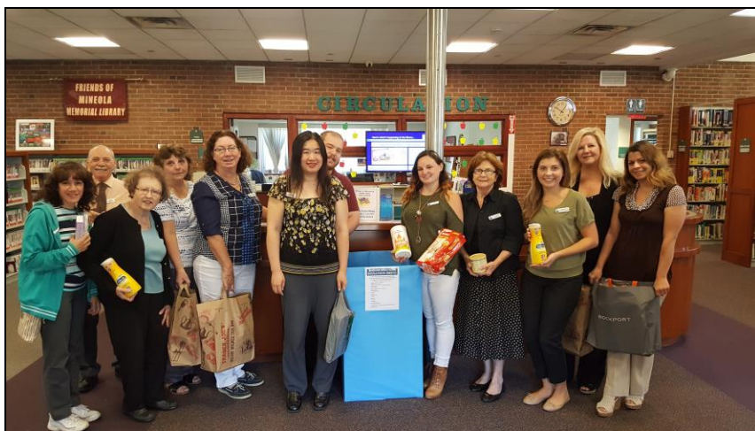
The staff of the Mineola Library organized a drop off point for Hurricane relief this past September. Items were sent to Texas, Florida and Puerto Rico.

The Syosset Public Library held its first ever pop culture event, called Sy-Con, on Friday, September 15, 2017 and Saturday, September 16, 2017. Beginning with a wizard jazz duo inspired by Harry Potter on Friday evening, and then offering 22 programs during the day on Saturday, activities included talks about Harry Potter, fandoms, photo ops, Cosplay contests, anime screenings, manga, trivia, gaming and special activities for children. An Artists Alley and Hot Dog truck rounded out the event which brought over 2,700 people to the library.