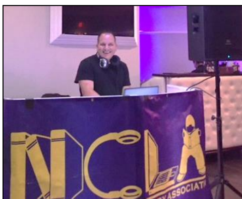
Entertainment by DJ Pace