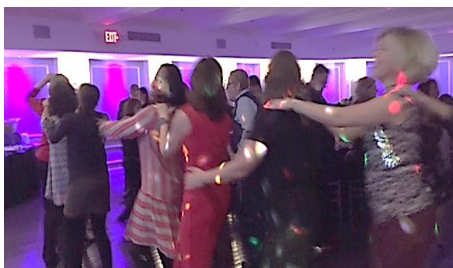
Conga Line on the Dance Floor