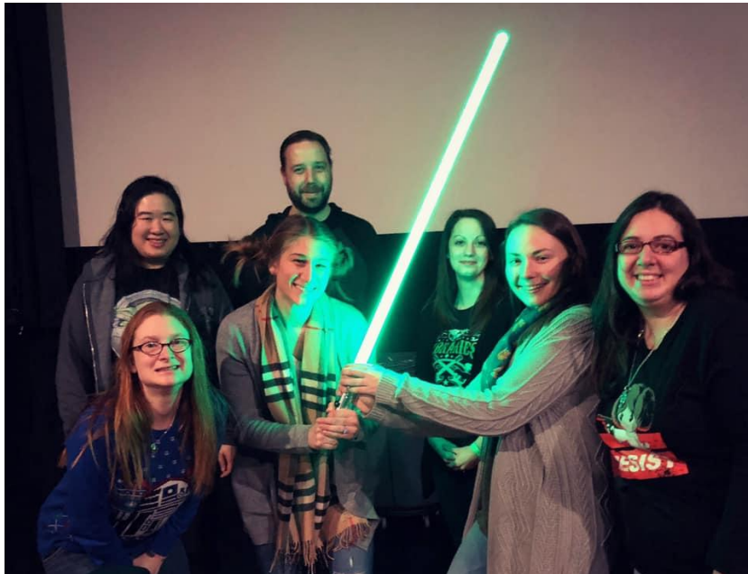
The NCLA Pop Culture Committee raffles a light saber at the NCLA showing of "Star Wars: The Rise of Skywalker."

The NCLA Pop Culture Committee finished out 2019 on a high note by filling The Bellmore Playhouse with a showing of "Star Wars: The Rise of Skywalker" for its annual fundraiser. Jedis of all ages enjoyed the latest Star Wars film, and the experience was made complete with popcorn, soda, and a raffle to win a light saber. All funds raised directly benefited NCLA. Thank you to all who attended!